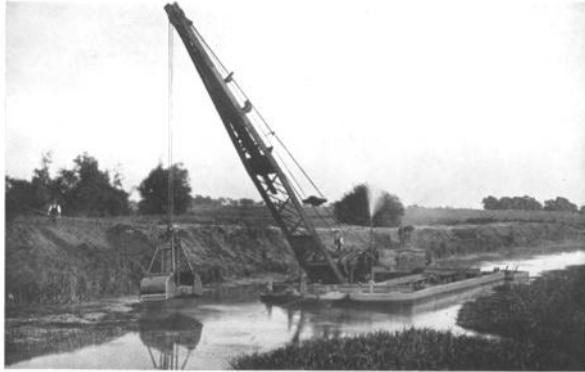
GRAB DREDGER "Kyme" DREDGING THE KYME EAU, LINCOLNSHIRE