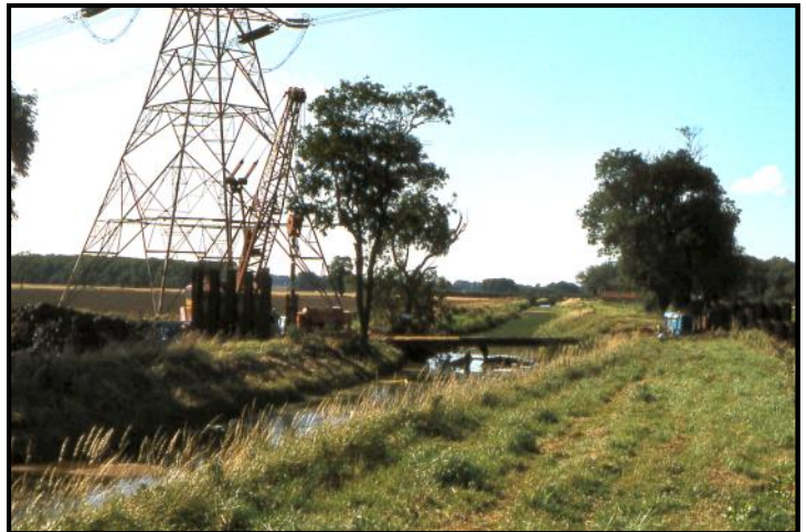
The gas pipeline being put under the Sleas above Haverholme Lock