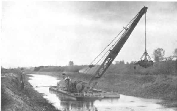
GRAB DREDGER "Kyme" DREDGING THE KYME EAU, LINCOLNSHIRE

MORNEMENT & RAY, LTD., Engineers & Contractors , EAST HARLING, NORFOLK