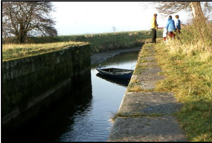
Bottom Lock before the gates

The following two photos are from some scanned slides: