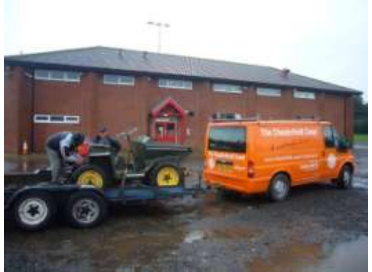
Loading up at Sleaford Rugby Club...

One of the benefits of volunteering is the friendships made with colleagues who share a common interest and also give up time to further the cause. This probably holds true whatever your chosen interest/obsession but it is certainly so in the case of waterway restoration.