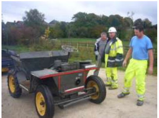
Inspection team on arrival....

For several years SNT has been in possession of a dump truck which has seen good service. Sadly it has not been used latterly because it is not licensed for use on the road and it has not been feasible to keep it at a location from whence it could be employed. A suitable