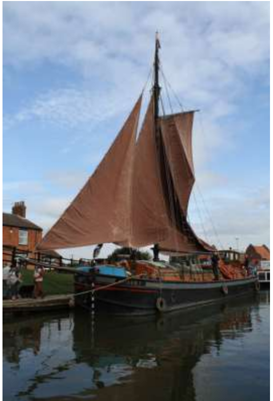
Spider T at West Stockwith

The Trust was invited to attend two “Fun Days” held at West Stockwith on September 21 st and 22 nd . Organised by Canal & River Trust, West Stockwith Yacht Club, the Waterfront pub and Chesterfield Canal Trust, the aim was to increase awareness and appreciation of local waterways. A previous successful event had been held at Trent Lock near Nottingham and indicates a welcome readiness in CRT to work closely with other organisations to further mutual aims.