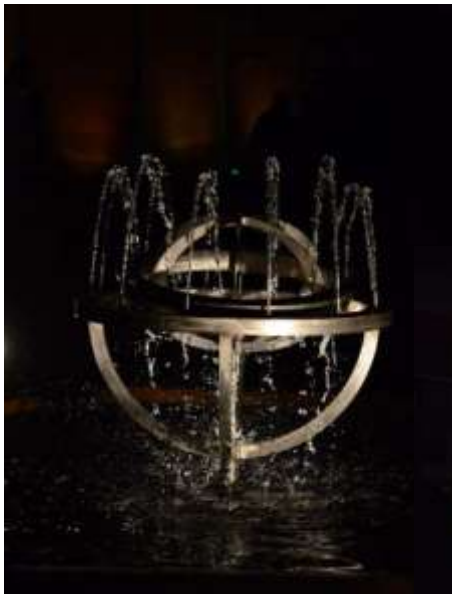
Zygote Festival

As well as other elements too numerous to mention in the festival which celebrated the town's seed heritage, an elegant water feature stood on the river bank on Eastgate Green