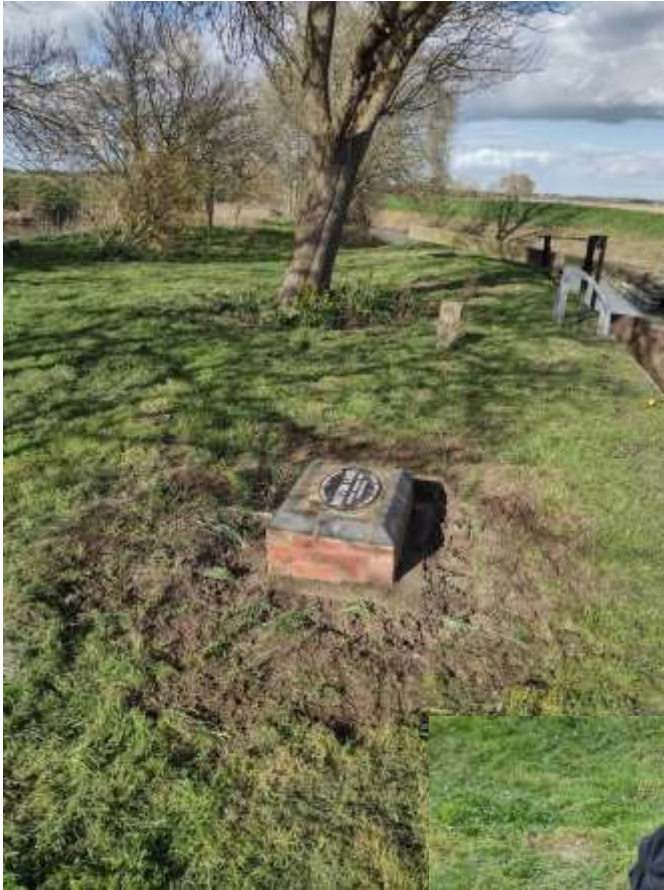
The March Work Party tidying up at Taylors Lock