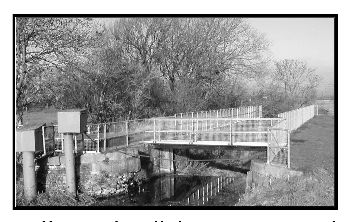
Metal fencing, recently erected by the Environment Agency, surrounds the historical remains of Evedon Lock

The Trust has been very concerned in the recent months by the fencing erected by the Environment Agency around some of the lock structures on the Slea and on other waterways.